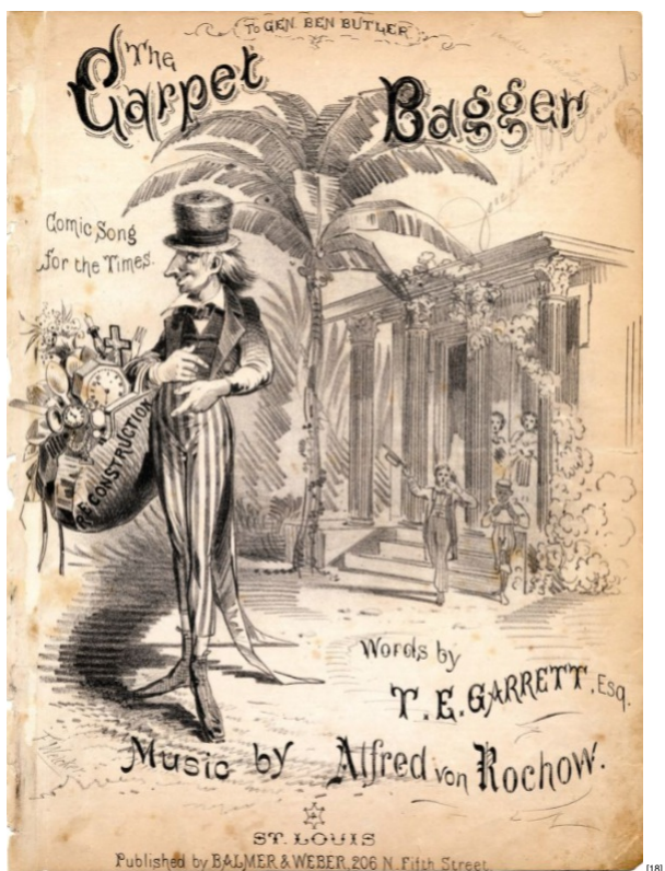
Sheet music cover and lyrics of the "comic song" called "The Carpetbagger." Cover shows a drawing of a carpetbagger with the spoils of Reconstruction in a large carpetbag.