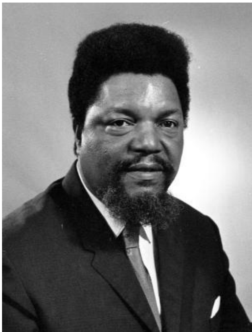
Robert Franklin Williams [8]