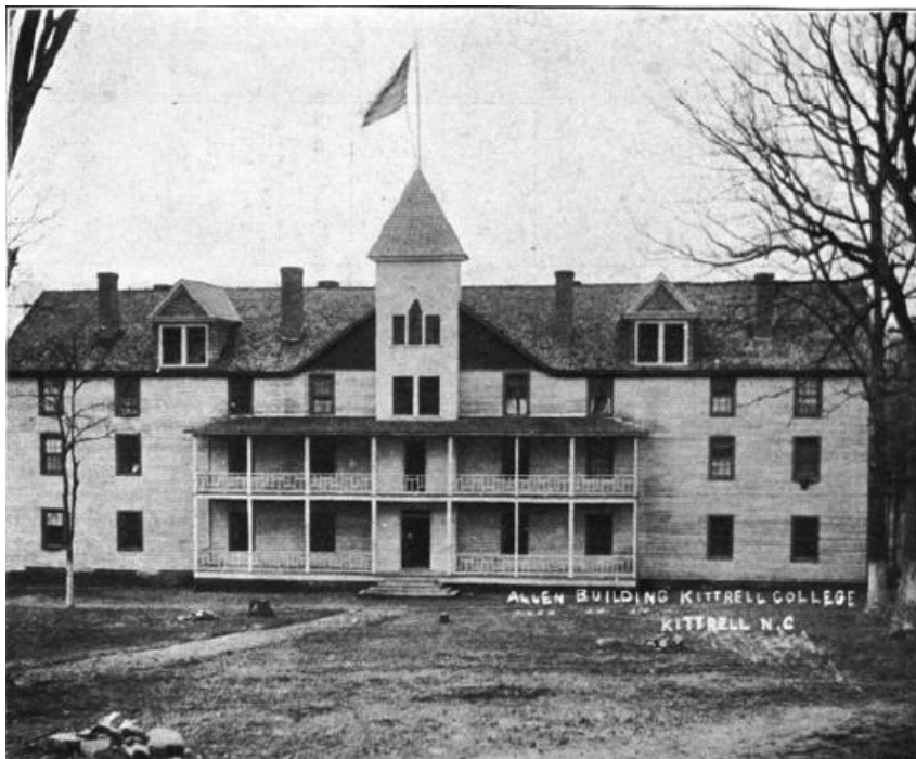
Photograph of Kittrell College, from An Era of Progress and Promise, 1908-1912.