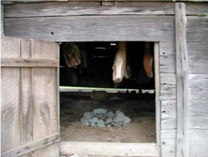
Photograph of the interior of a traditional North Carolina smokehouse at the Cedarock Historical Farm in Alamance County, N.C.

Following World War II, nostalgia had transformed the hardships and deprivation of the depressed years between the two world wars into "hog and hominy days," when sturdy yeoman families lived contentedly on the simple abundance of nature. Old-timers in an urban and industrial age remember with special fondness the farm barns of their adolescence, the big cornfields, the vast cribs where the corn was stored, and aromatic smokehouses in which corn-fed pork was cured. During the depression years, as in earlier times, cattle and hogs foraged for themselves in woods and fields and returned in the evening to the high-pitched summons of the cattle call and "coor pig" that resounded across bucolic distances. In the fall, hogs were penned and fattened on "slops" from the kitchen, sweet potatoes, and such corn as was unfit for either