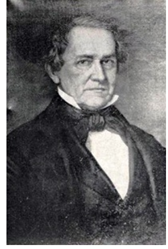
Photograph of a a portrait of Robert Strange.