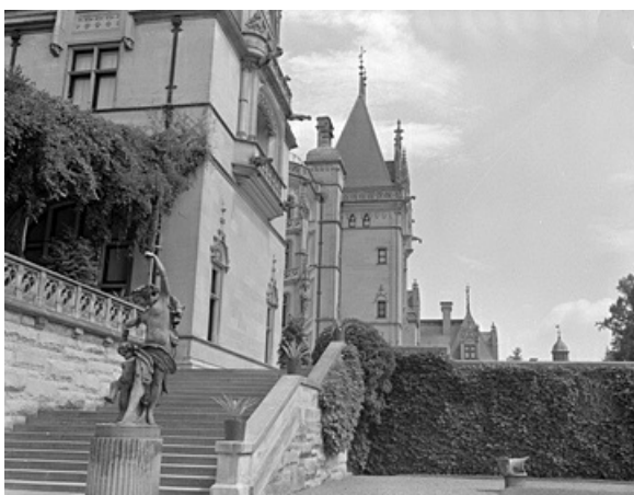
Biltmore House, Asheville, NC, 1950.

Gifford Pinchot [15] managed the reforestation project. The first trained forester in the United States, Pinchot planned New York State's Adirondack Park [16] and founded the U.S. Forest Service [17] . Vanderbilt's forest, named Pisgah Forest [2] , began about 10 miles from Biltmore and extended 60 miles to the west. Pinchot established the Biltmore Forest School [18] and developed a comprehensive plan to continue the tree nursery, reforestation, and harvest projects. His principles of sustained yield, which struck a balance between cutting timber and growing new trees, first developed at Biltmore and remain standard practice in forestry today. The estate also had a dairy farm, a pig farm, and a poultry farm on site.