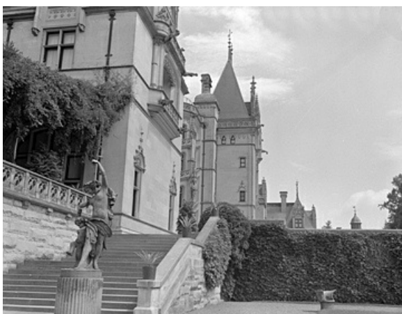
Biltmore House, Asheville, NC, 1950.

Gifford Pinchot [15] managed the reforestation project. The first trained forester in the United States, Pinchot planned New York State's Adirondack Park [16] and founded the U.S. Forest Service [17] . Vanderbilt's forest, named Pisgah Forest [2] , began about 10 miles from Biltmore and extended 60 miles to the west. Pinchot established the Biltmore Forest School [18] and developed a comprehensive plan to continue the tree nursery, reforestation, and harvest projects. His principles of sustained yield, which struck a balance between cutting timber and growing new trees, first developed at Biltmore and remain standard practice in forestry today. The estate also had a dairy farm, a pig farm, and a poultry farm on site.