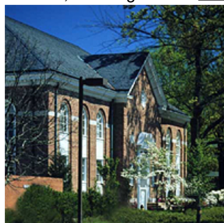
Barton College. Image courtesy of CFNC.

In 1990, in recognition of Barton Warren Stone [11] (1772-1844), one of the progenitors of the Disciples of Christ de