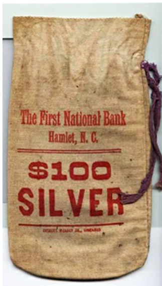
Money bag from the First National Bank in Hamlet. Image from the Museum of

See also: Bank of America [2] ; Bank of Cape Fear [3] ; Branch Banking and Trust Company [4] ; Central Carolina Bank & Trust Company [5] ; State Bank of North Carolina [6] ; Wachovia Corporation [7] .