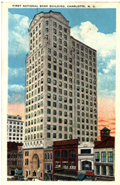
Postcard of the First National Bank in Charlotte, 1927-1930. Image from the

North Carolina Museum of History. [17] National banking came to North Carolina when the First National Bank of Charlotte was chartered on 1 Aug. 1865, followed on 12 September by the Raleigh National Bank of North Carolina. In 1866 three additional national charters were granted for banks in New Bern, Wilmington, and Salem. There were no banks chartered by the state until the Bank of Greensboro on 7 Apr. 1869. The state continued to struggle with the economic effects of the Civil War. In the 30 banks in operation in the state in 1875, total deposits were only $250,000.