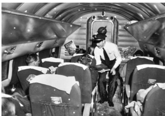
Interior of a Piedmont Airlines plane, 1950.

Truly phenomenal growth occurred in the wake of the federal government's decision in August 1978 to deregulate the nation's air carriers. Liberalized route and fare policies meant that strongly positioned regional carriers like Piedmont could branch out quickly and competitively. Los Angeles, Denver, Dallas, San Francisco, and Phoenix were added to Piedmont's system; in less than a decade the airline inaugurated international service with flights to London. The immediate consequence of deregulation was a dramatic increase in Piedmont's size as an airline and in its number of passengers. In 1969 it served 78 cities and carried 2.2 million passengers. In 1984 it carried 13 million passengers and passed the $1 billion mark in revenues. By 1987 it was carrying 23 million passengers a year to 235 destinations.