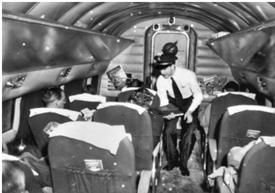
Interior of a Piedmont Airlines plane, 1950.

Truly phenomenal growth occurred in the wake of the federal government's decision in August 1978 to deregulate the nation's air carriers. Liberalized route and fare policies meant that strongly positioned regional carriers like Piedmont could branch out quickly and competitively. Los Angeles, Denver, Dallas, San Francisco, and Phoenix were added to Piedmont's system; in less than a decade the airline inaugurated international service with flights to London. The immediate consequence of deregulation was a dramatic increase in Piedmont's size as an airline and in its number of passengers. In 1969 it served 78 cities and carried 2.2 million passengers. In 1984 it carried 13 million passengers and passed the $1 billion mark in revenues. By 1987 it was carrying 23 million passengers a year to 235 destinations.