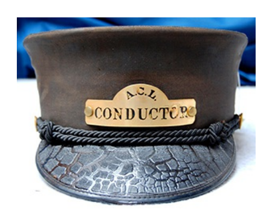
Atlantic Coast Line Railroad conductor's hat, circa 1950.

the ACL remained passenger-oriented, though local and branch Historic Sites. service had been curtailed.