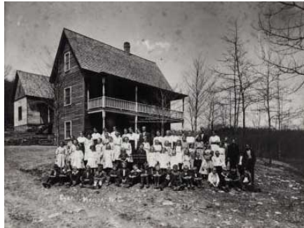
Appalachian Industrial School, ca. 1911-1914.

See also: Penland School of Crafts [2] .of Crafts Archives.