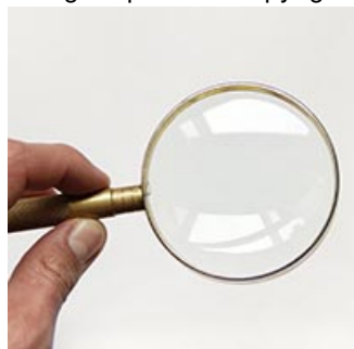
How to Search [5]