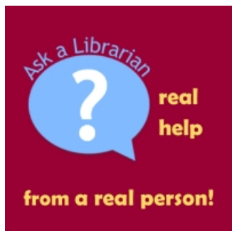
Get help from a librarian [2]

Here are ways to help you get the most from NCpedia and to support your research needs. From live support by real librarians to subject collections and search features, check them out!