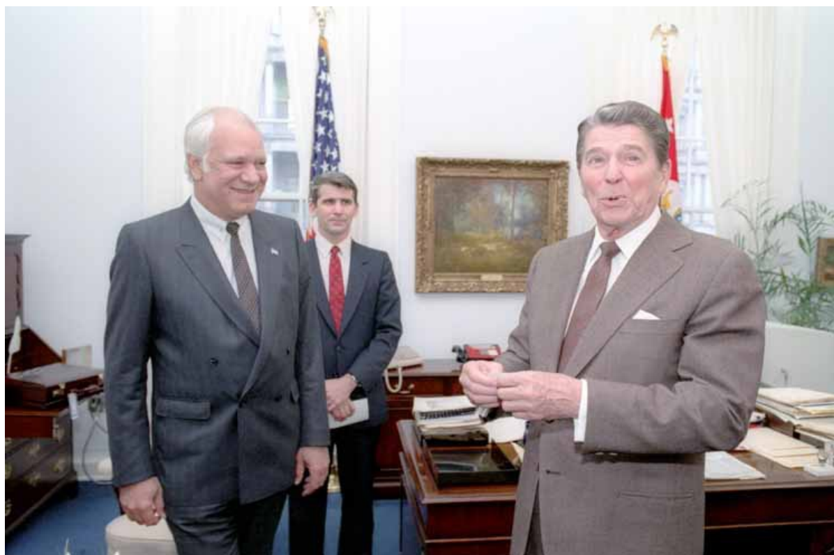
In 1985, President Ronald Reagan meets with Adolfo Calero, a Nicaraguan Democratic Resistance (Contra) leader, and Oliver North.

In foreign policy, Reagan sought a more assertive role for the nation, and Central America provided an early test. The United States provided El Salvador with a program of economic aid and military training when a guerrilla insurgency threatened to topple its government. It also actively encouraged the transition to an elected democratic government, but efforts to curb active right-wing death squads were only partly successful. U.S. support helped stabilize the government, but the level of violence there remained undiminished. A peace agreement was finally reached in early 1992.