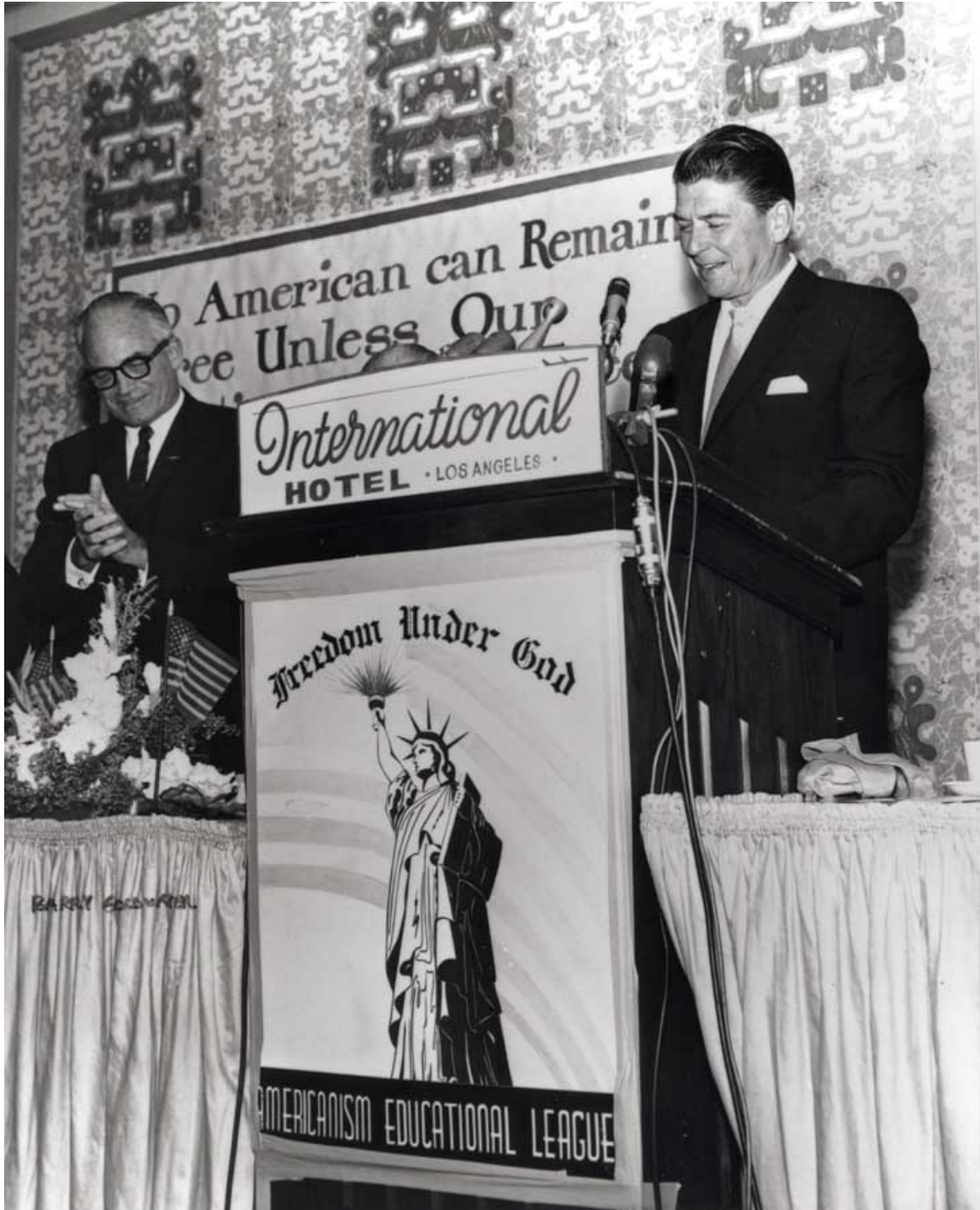
In 1964, Ronald Reagan delivers a speech in support of presidential candidate Barry Goldwater.

The "Old" Goldwater Right had favored strict limits on government intervention in the economy. This tendency was reinforced by a significant group of "New Right" "libertarian conservatives" who distrusted government in general and opposed state interference in personal behavior. But the New Right also encompassed a stronger, often evangelical faction determined to wield state power to encourage its views. The New Right favored tough measures against crime, a strong national defense, a constitutional amendment to permit prayer in public schools, and opposition to abortion.