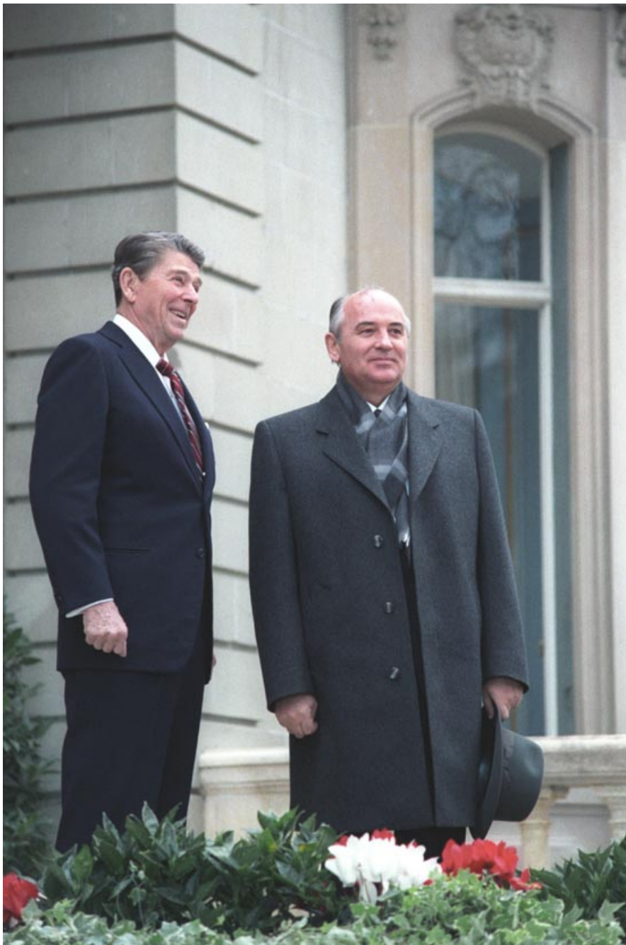
President Reagan during his first meeting with Soviet General Secretary Mikhail Gorbachev during the Geneva Summit in Switzerland in 1985.

In relations with the Soviet Union, President Reagan's declared policy was one of peace through strength. He was determined to stand firm against the country he would in 1983 call an "evil empire." Two early events increased U.S.-Soviet tensions: the suppression of the Solidarity labor movement in Poland in December 1981, and the destruction with 269 fatalities of an off-course civilian airliner, Korean Airlines Flight 007, by a Soviet jet fighter on September 1, 1983. The United States also condemned the continuing Soviet occupation of Afghanistan and continued aid begun by the Carter administration to the mujahedeen resistance there.