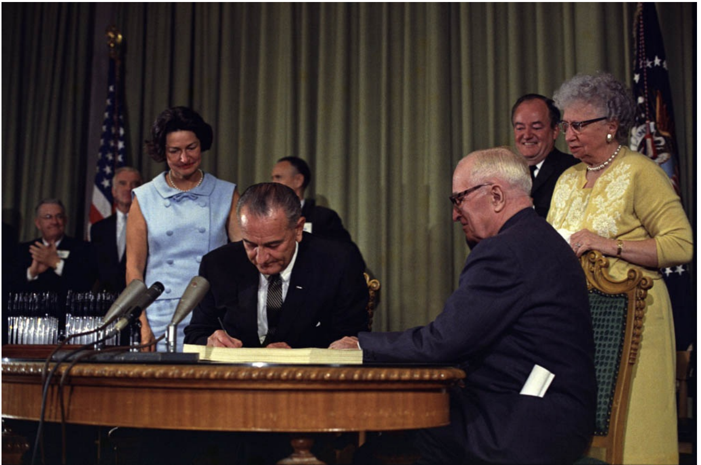
President Johnson signs the Medicare bill in 1965.

The War on Poverty became the centerpiece of the administration's Great Society program. The Office of Economic Opportunity, established in 1964, provided training for the poor and established various community-action agencies, guided by an ethic of "participatory democracy" that aimed to give the poor themselves a voice in housing, health, and education programs.