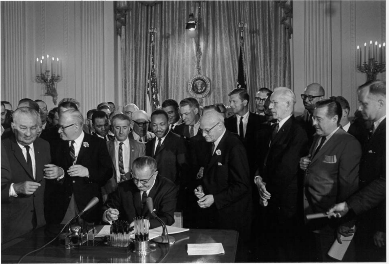
President Lyndon Johnson signs the Civil Rights Act into law.