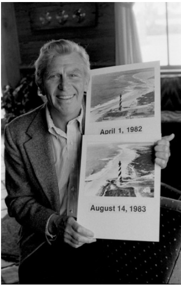
Andy Griffith and Cape Hatteras Lighthouse photos