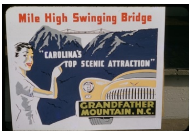
Advertisement for Grandfather Mountain

By the twentieth century, the Outer Banks, the links of Pinehurst, and mountain destinations from Linville to Sapphire Valley drew growing numbers of visitors, first arriving by rail and, by the 1920s, by car. Tourism evolved to be more than a route to economic development. It became a catalyst for a myriad of changes that shaped the state and reinforced the Old North State's reputation -- deserved or not -- as a bastion of progressive ideals. Tourism promoters helped to lead the "Good Roads" movement which would establish one of the best state highway systems in the South.