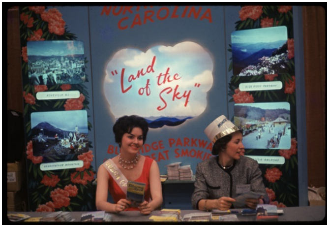
'Land of the Sky'

After the war, tourism emerged anew. While some North Carolina communities turned to textiles, tobacco, or furniture as routes to post-Civil War prosperity, other looked to tourism to carve out a place for themselves in the New South. Just as in the twentieth century, image making and tourism went hand in hand in post-Civil War North Carolina.