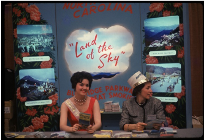
'Land of the Sky'

After the war, tourism emerged anew. While some North Carolina communities turned to textiles, tobacco, or furniture as routes to post-Civil War prosperity, other looked to tourism to carve out a place for themselves in the New South. Just as in the twentieth century, image making and tourism went hand in hand in post-Civil War North Carolina.