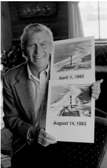
Andy Griffith and Cape Hatteras Lighthouse photos