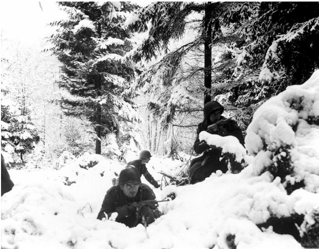
American soldiers of the 290th Regiment fight in the snow near Amonines, Belgium.