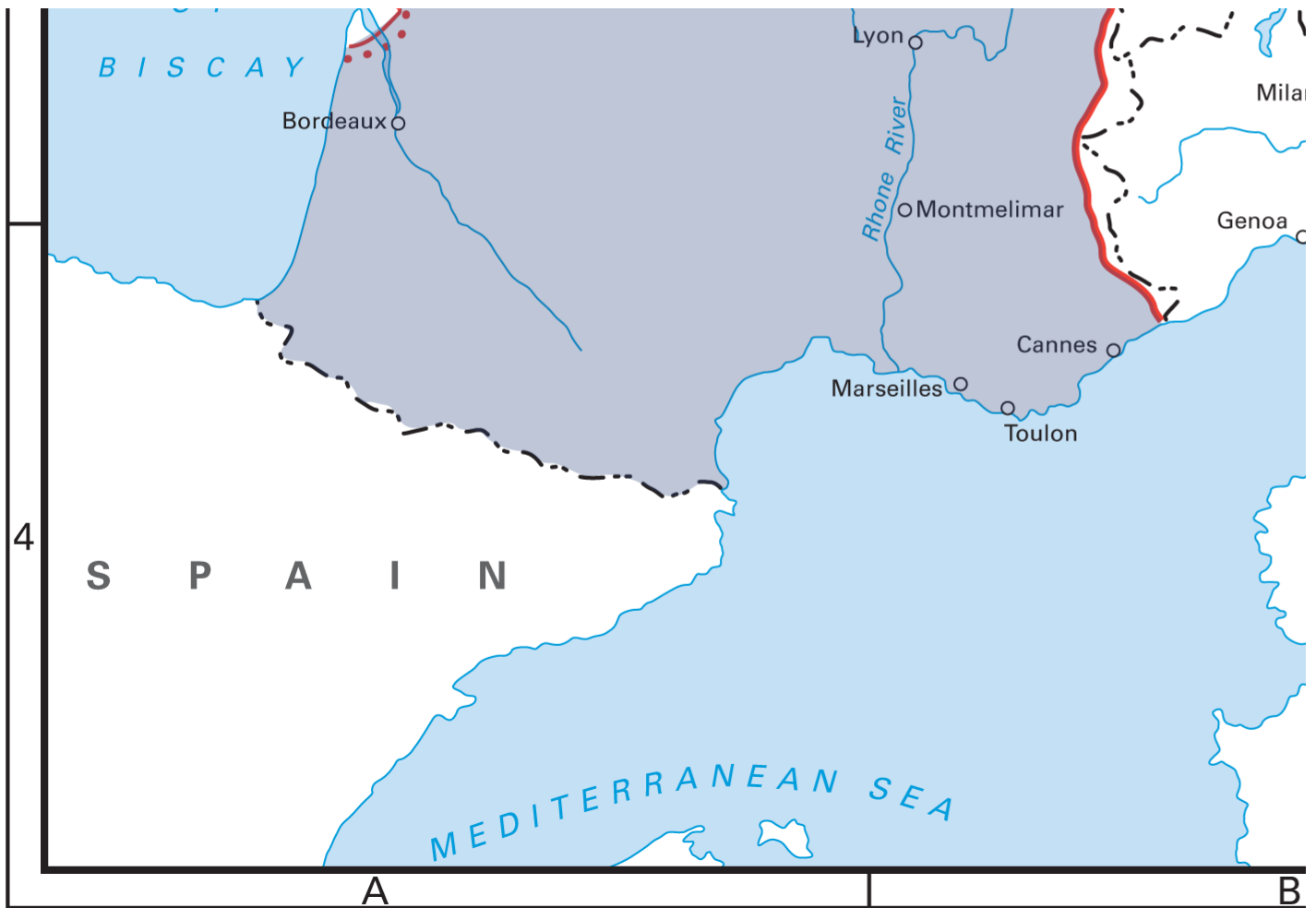
[2] Allied gains in Europe between June and December 1944.

After the D-Day invasion, the Allies needed only two months to reach Paris and liberate the French capital from Nazi occupation. Allied troops were met by cheering crowds, Charles de Gaulle, leader of the French resistance, led a parade down the Champs Elysees and through the Arc de Triomphe. But after that moment of joy, the war went on, as Allied armies continued pushing the Germans eastward towards the Rhine River and the German border. And for Parisians, as for all Europeans after the war, life after "liberation" could be as difficult as life before.