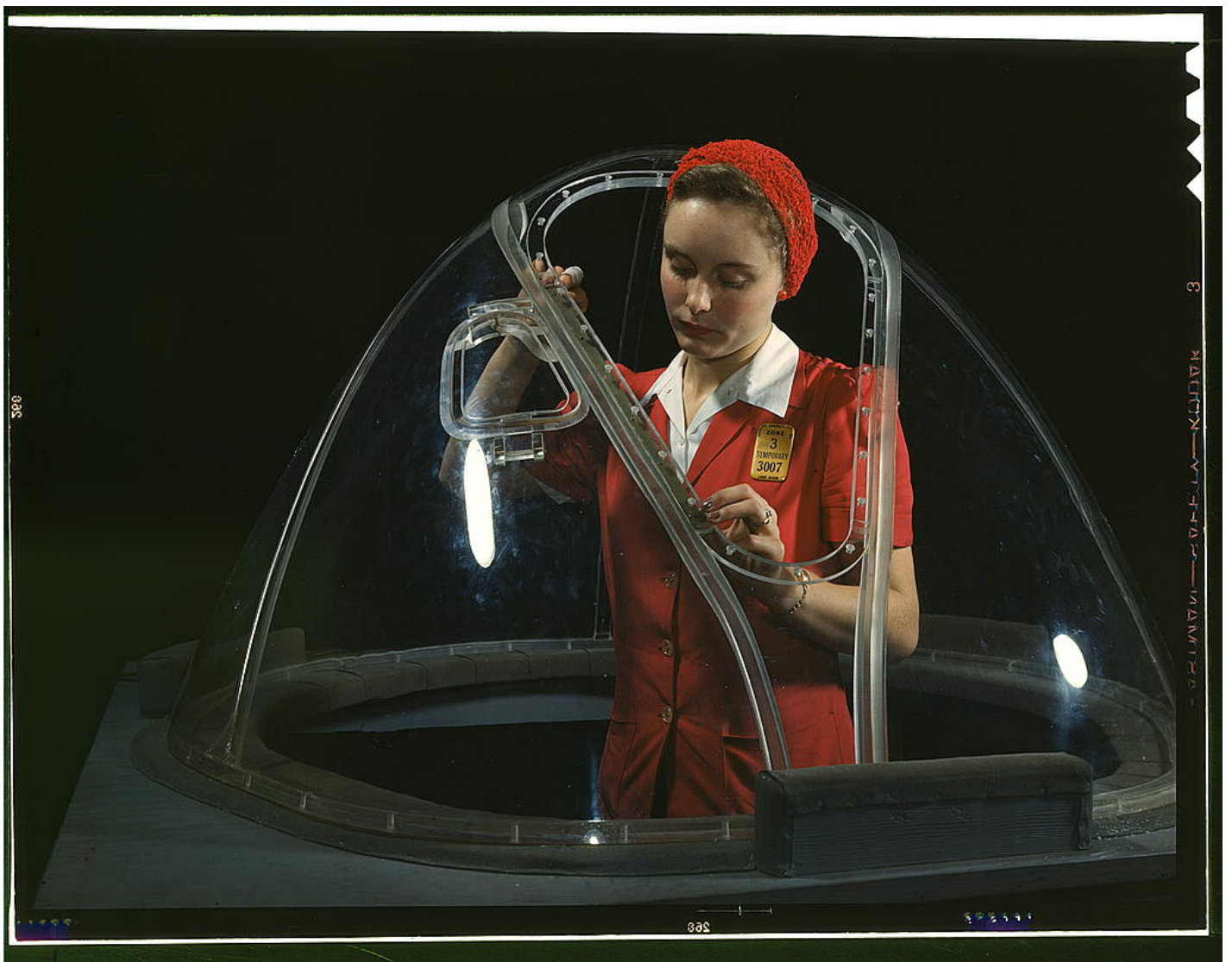
A woman works on the nose of a bomber at the Douglas Aircraft Company plant in Long Beach, California in 1942.