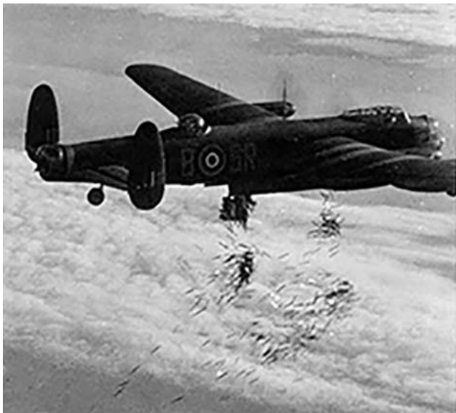
The Lancaster dropping chaff over a target in Duisburg.