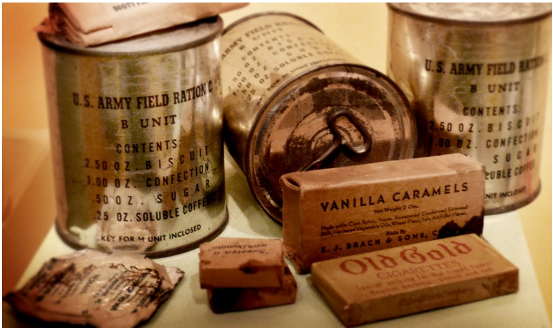
A variety of military C-rations on display.