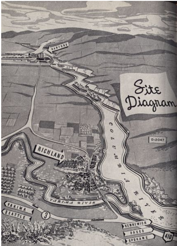
This diagram of Hanford, Washington, was created to show its strategic location for creating plutonium.