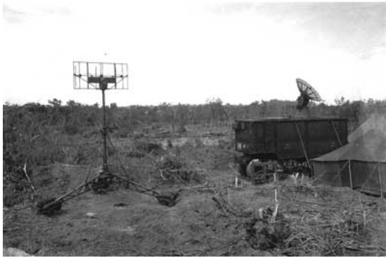
Radar system in operation in Palau during World War II.