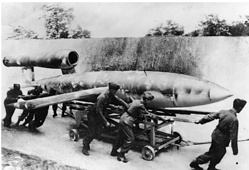
The V-1 or "buzz bomb" was one of the early bombers used during World War II.