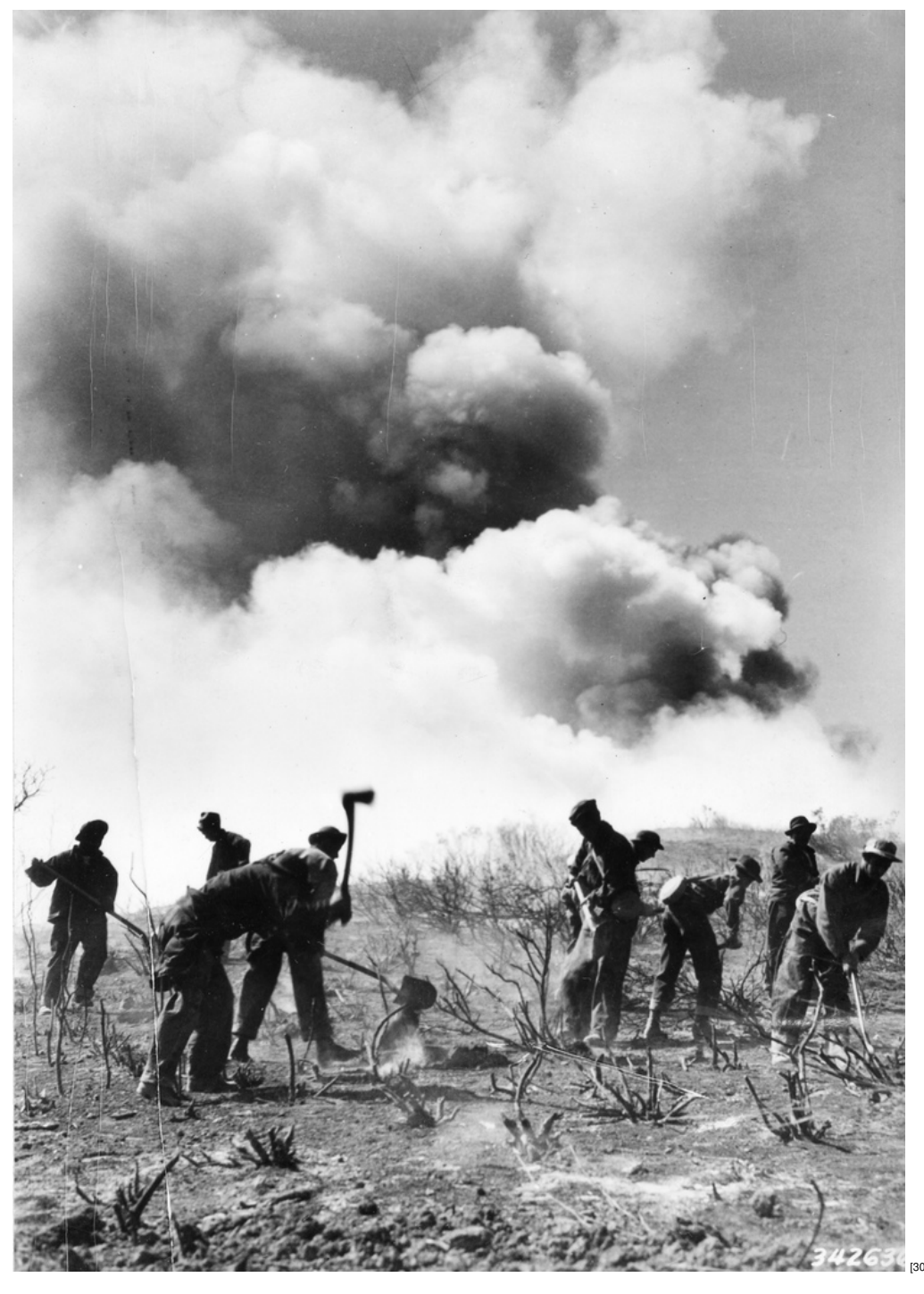
Members of the Civilian Conservation Corps work to control a wildfire near Angeles National Forest, California, in 1935.