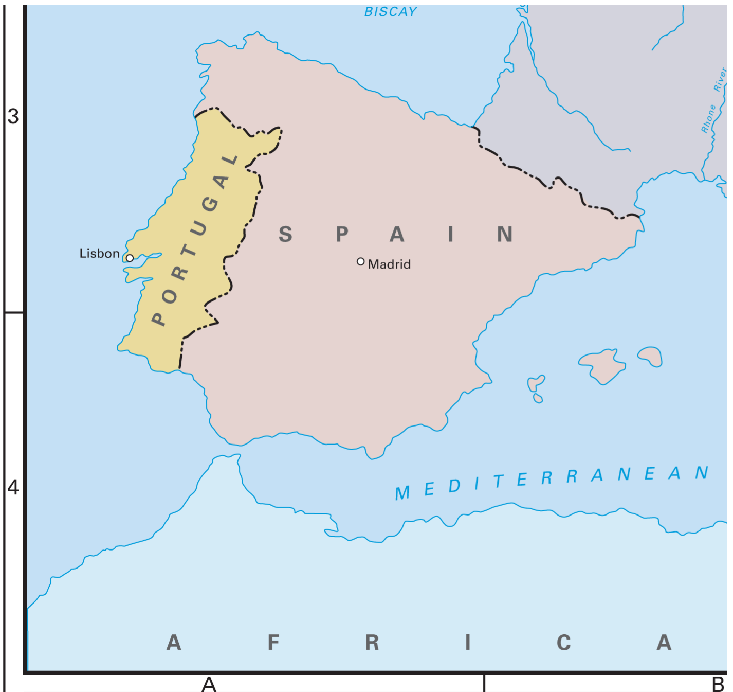
[6] Europe in 1919, with national boundaries redrawn by the Treaty of Versailles.

While the Treaty of Versailles did not present a peace agreement that satisfied all parties concerned, by the time President Woodrow Wilson returned to the United States in July 1919, Americans overwhelmingly favored ratifying the treaty, including the Covenant of Nations. Thirty-two state legislatures passed resolutions in support of the treaty. But there was intense opposition to it within the Senate, which had to ratify [6] the treaty before it could become binding on the United States. The Treaty of Versailles fell seven votes short of ratification [7] , and the United States signed a separate treaty with Germany in 1921. The U.S. never joined the League of Nations.