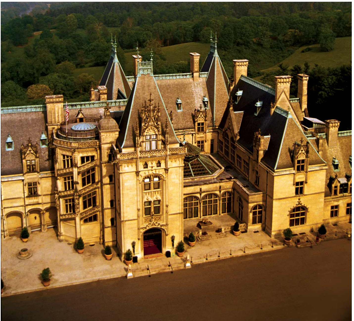
An aerial view of the extensive and extravagant Biltmore Mansion

Today the Biltmore Estate maintains its majestic presence. The French Broad River runs through the estate's 8000 acres. Beautiful mountain timberland isolates Biltmore from Asheville's surrounding development. Annually, thousands of visitors arrive. They marvel at the indoor pool, huge library, 64-seat banquet table, and bowling alley — all constructed in the 19th century. Vanderbilt loved to travel and frequently visited Asia, Africa, and Europe. On those trips he purchased hundreds of rare furniture pieces, tapestries, art, books, and novelties. Complementing the grand architecture of Biltmore, these items now fill the house's wondrous interior.