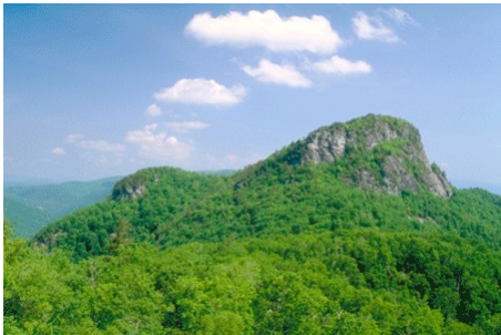
Asheville, North Carolina