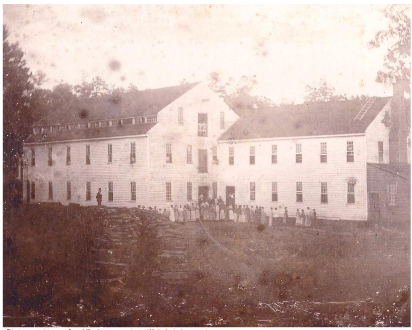
[16] This photograph of Alamance Cotton Mill and workers was taken in 1837 shortly after its construction