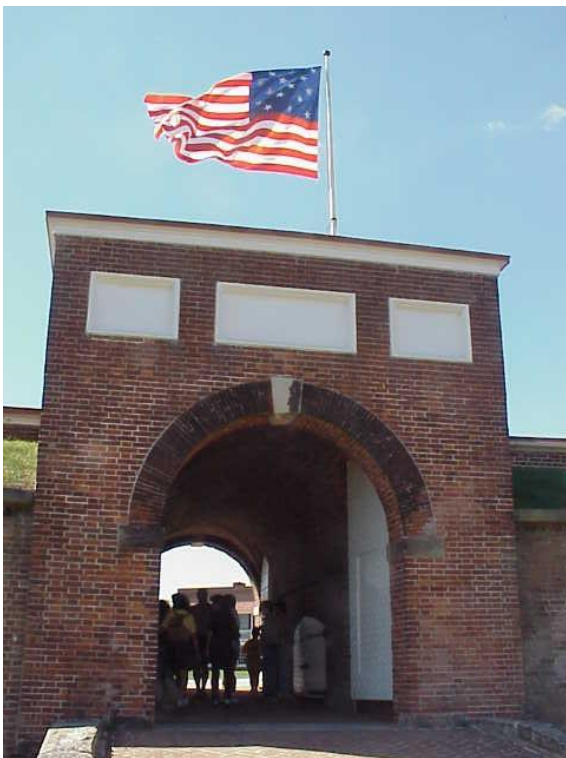
In 1814, American forces fought off a British sea invasion of the busy port city of Baltimore, Maryland. The American defense of Baltimore's Fort McHenry (seen here) inspired Francis Scott Key to write "The Star-Spangled Banner."