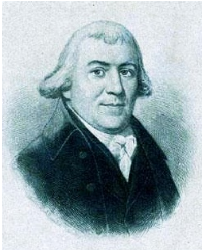
James Iredell, Sr. [26] (1751–1799)