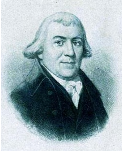
James Iredell, Sr. (1751–1799)