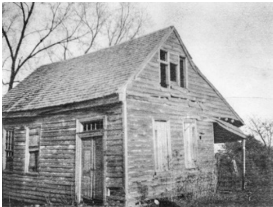
Constitution-Burgess House, Halifax, N.C. [40] Tradition holds that N.C.'s first state constitution was framed here.