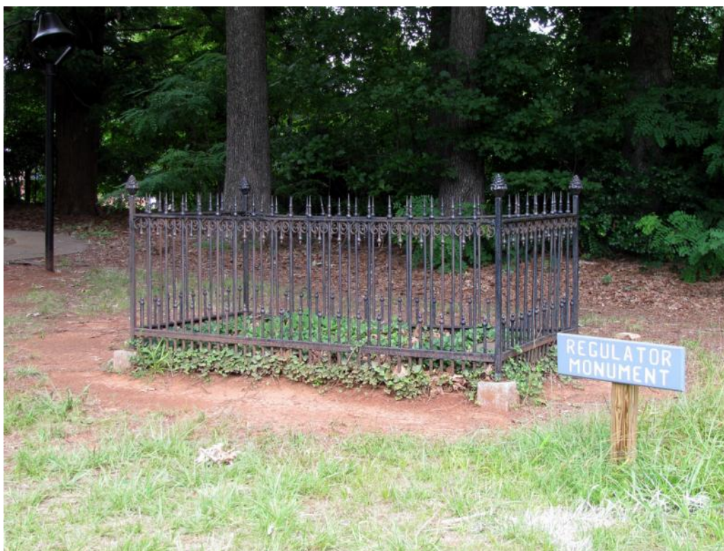
[24] A white marble slab in Hillsborough,

N.C. [24] marks the spot where six Regulators were hanged on June 19, 1771, after their defeat at the Battle of Alamance.