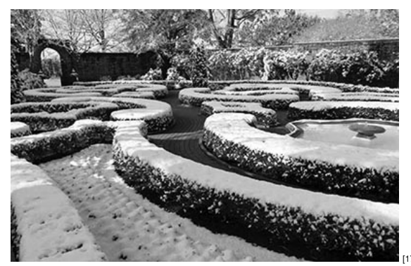
Tryon Palace [18] (NCpedia) [18] Tryon Palace (Historic Site [19])