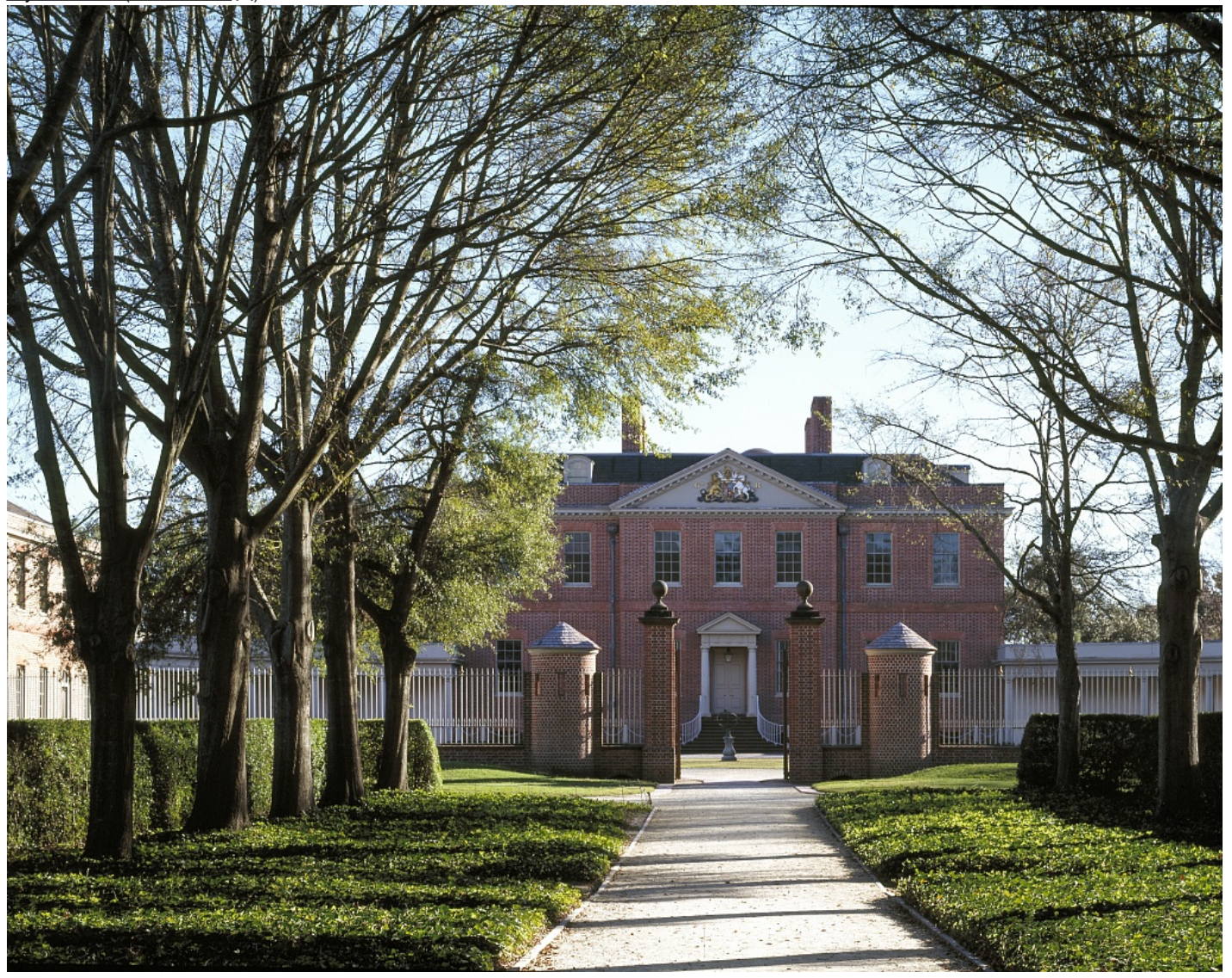
The palace built by Governor William Tryon in the 1760s stands in marked contrast to the homes of most backcountry settlers.