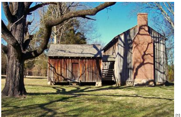
At Stagville, North Carolina's largest plantation, more than nine hundred enslaved people worked on its thirty thousand acres in 1860, living in quarters like those shown here.