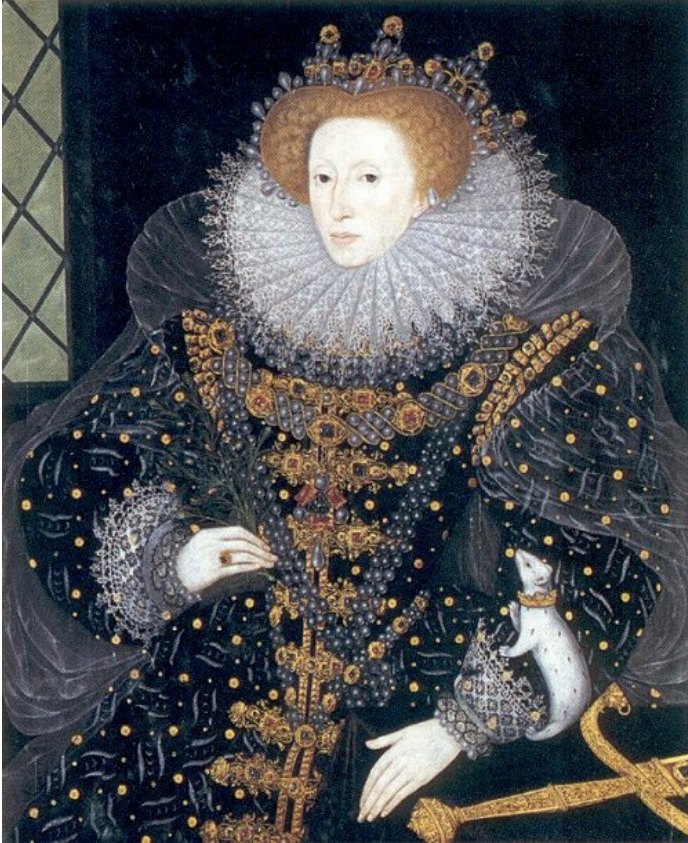
Nicholas Hilliard's 1585 portrait of Queen Elizabeth.

The family tree of the House of Tudor shows how complicated the royal succession could become.