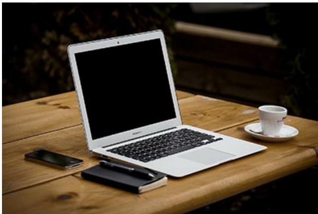
Citing NCpedia articles

Need help citing NCpedia articles? Have questions about copyright and permissions? This article discusses where to find help for creating citations and how to find copyright information for NCpedia articles.