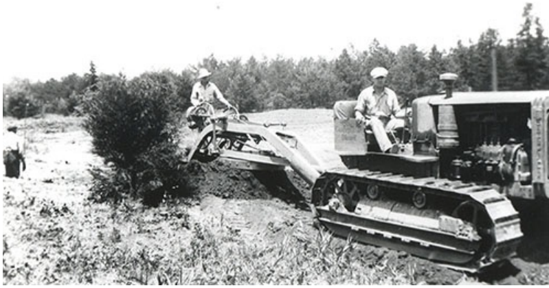
Workers clearing areas of what is now Umstead State Park, ca. 1940-1950.

The past continues to influence the park's ecology. The stone dams of grist mills held back sediments and shaped the stream bank. Roadbeds remain marked in the landscape. And ornamental plants continue to endure amidst the forest.