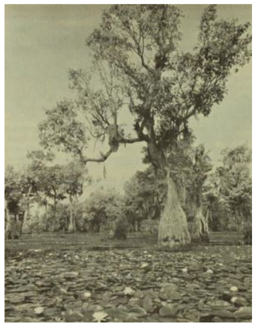
Photograph of Merchants Millpond, ca. 1970s. From the Merchants Millpond State Park Master Plan, 1979, N.C. Division of Parks and

Recreation. Presented on Archive.org [5]Settlement in the Gates County area began in 1660. Residents of early rural communities made a living by farming and lumbering. In the early 1700s, Hunters Millpond was built at the head of Bennetts Creek to provide a means of processing and marketing regional produce. Highway construction destroyed this millpond in 1922. But further downstream, Norfleets Millpond, which was built in 1811, thrived. Gristmills, a sawmill, a farm supply store and other enterprises made the pond area the center of trade and merchant activity in Gates County. Thus, the pond later became known as Merchants Millpond.