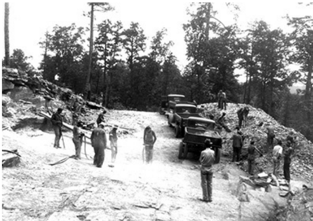
Workers in the Civilian Conservation Corps at the rock quarry during dam construction, ca. 1935-1942, at Hanging Rock State Park.

More than 704 species of mountain flora are found in the park. The most abundant plants are rhododendron, azalea, galax, mountain laurel and a wide variety of ferns. The majority of the park is forested by oak and pine, but in moist locations hemlock provides a canopy. Hanging Rock is one of the few places where Canadian and Carolina hemlock grow side by side.