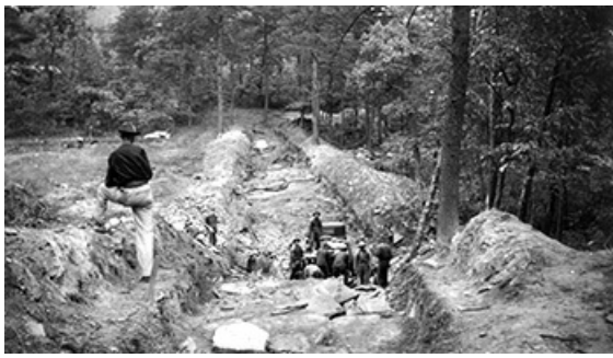
Workers in the Civilian Conservation Corps at the rock quarry during dam construction, ca. 1935-1942, at Hanging Rock State Park. Image from the

The park's collection of North Carolina State Parks.