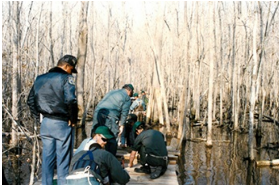
Building the Palmetto Boardwalk, Goose Creek State Park, photograph circa 1980.

Evergreen shrubs and trees grow in the ecotone between marsh and swamp. Shrubs include wax myrtle, red bay and groundsel tree. Red cedar and loblolly pine trees form the over story. The brackish marsh gradually fades into swamp where a canopy of black gum, tupelo, red maple, bald cypress and ash reaches up to 90 feet. Wax myrtle, gallberry and red bay are abundant in the understory. Pennywort and ferns flourish in the boggy freshwater swamp.