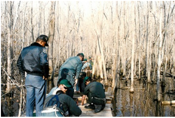
Building the Palmetto Boardwalk, Goose Creek State Park, photograph circa 1980.