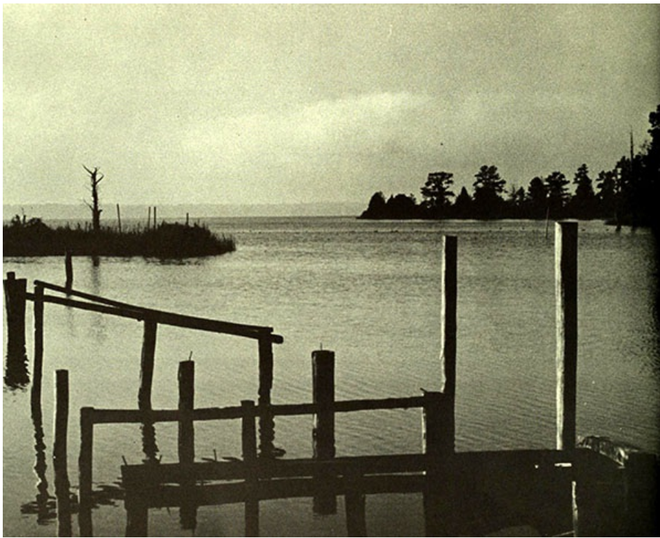
Photograph of Goose Creek State Park, ca. 1976. From the Goose Creek State Park Master Plan , 1976, N.C. Division of Parks and Recreation.

Frogs, turtles and snakes enjoy the wetlands of Goose Creek. Even though the water is slightly saline, snakes, including the banded and red-bellied water snakes and the venomous cottonmouth are present. Minks, muskrats, raccoons and river otters enjoy the brackish marshes. A variety of other mammals, including gray squirrels, opossums and white-tailed deer, find food and protective cover throughout the park. Marsh rabbits live in moist areas, while eastern cottontails prefer the drier uplands. The tracks of elusive bobcats, black bears, gray foxes and red wolves testify to the presence of these rarely encountered creatures.