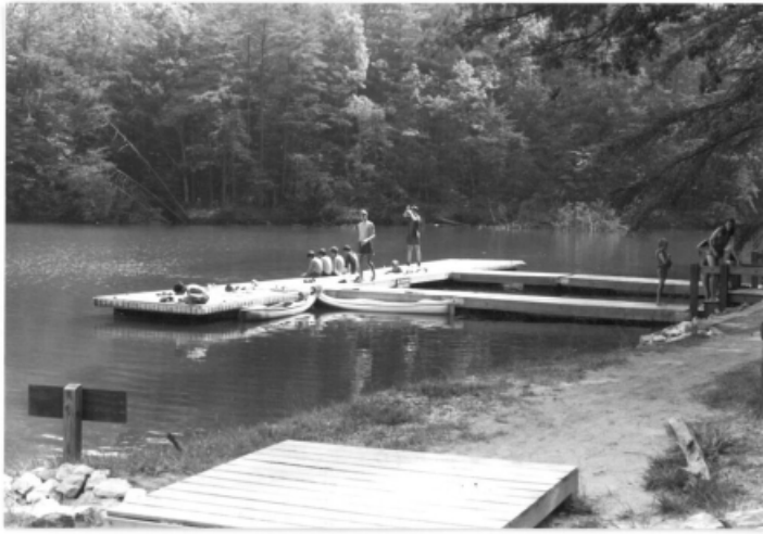
Photograph of swimmers at a dock on the Catawba River, Lake James State Park, ca. 1990.