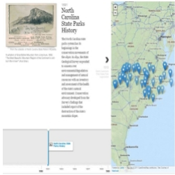
North Carolina State Parks History Interactive Timeline in NCpedia. [2]

The North Carolina State Parks system was launched on March 3, 1915 when the General Assembly passed legislation appropriating funds to buy land for a park at Mount Mitchell. A year later, following the acquisition of 795 acres at the mountain's summit, Mount Mitchell became the state's first park and the first park in the southeastern United States. Today the North Carolina State Parks system covers 225,000 acres from the mountains to the sea.