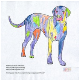
Plot Hound Coloring Page