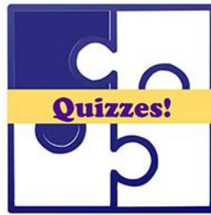
[3] NCpedia Quizzes!