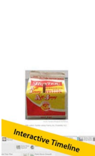
State Symbols Timeline

To read entries about many of North Carolina's most well-known state symbols and the history of North Carolina in Spanish, visit this NCpedia link: https://ncpedia.org/libro-de-hechos-de-el-viejo-estado-del-norte [6]