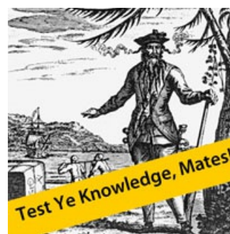
Take a NC History Quiz! [8]