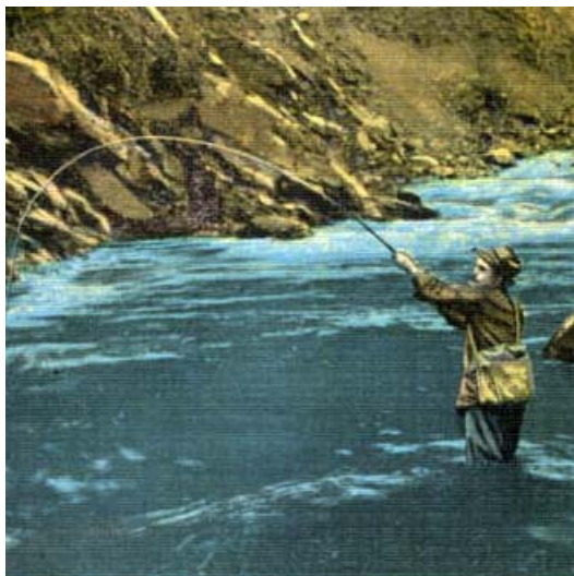
Featured State Symbol [7]