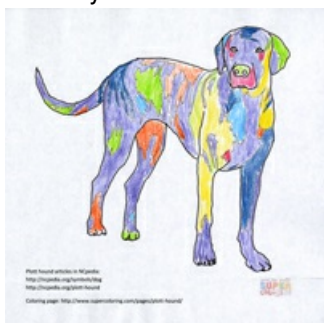
State Symbols Coloring Pages [10] Historia y símbolos en español [6]