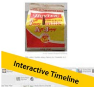
State Symbols Timeline

To read entries about many of North Carolina's most well-known state symbols and the history of North Carolina in Spanish, visit this NCpedia link: https://ncpedia.org/libro-de-hechos-de-el-viejo-estado-del-norte [6]