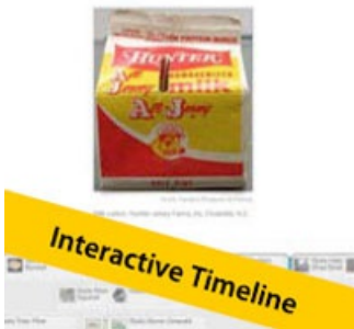
State Symbols Timeline [7]

To read entries about many of North Carolina's most well-known state symbols and the history of North Carolina in Spanish, visit this NCpedia link: https://ncpedia.org/libro-de-hechos-de-el-viejo-estado-del-norte [6]