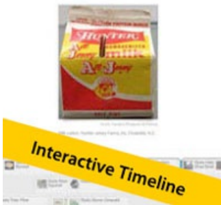
State Symbols Timeline

To read entries about many of North Carolina's most well-known state symbols and the history of North Carolina in Spanish, visit this NCpedia link: https://ncpedia.org/libro-de-hechos-de-el-viejo-estado-del-norte [6]