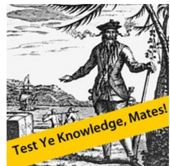
[8] Take a NC History Quiz!