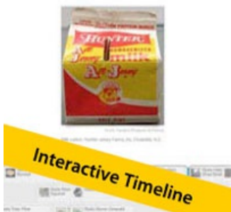
State Symbols Timeline [7]

To read entries about many of North Carolina's most well-known state symbols and the history of North Carolina in Spanish, visit this NCpedia link: https://ncpedia.org/libro-de-hechos-de-el-viejo-estado-del-norte [6]