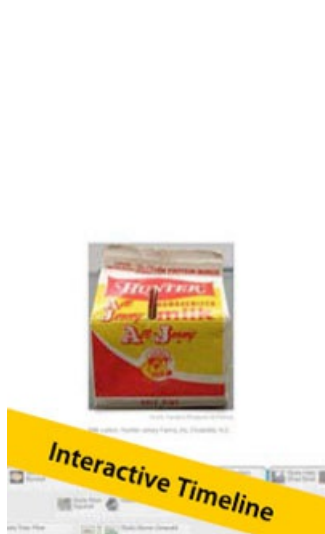
State Symbols Timeline

To read entries about many of North Carolina's most well-known state symbols and the history of North Carolina in Spanish, visit this NCpedia link: https://ncpedia.org/libro-de-hechos-de-el-viejo-estado-del-norte [6]