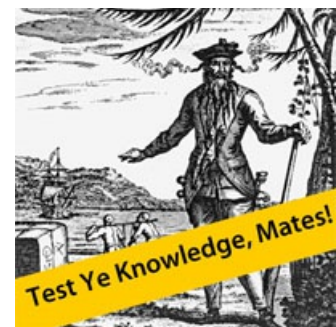
[8] Take a NC History Quiz!