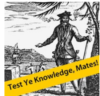
[8] Take a NC History Quiz!