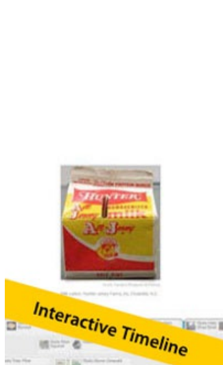
State Symbols Timeline

To read entries about many of North Carolina's most well-known state symbols and the history of North Carolina in Spanish, visit this NCpedia link: https://ncpedia.org/libro-de-hechos-de-el-viejo-estado-del-norte [6]