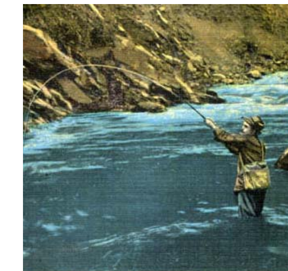
[7] Featured State Symbol