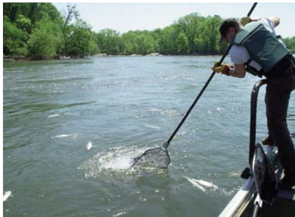
Restoration of this fish has become a modern-day

The striped bass is one of the most important food and game fish found in the coastal waters of the United States. Striped bass populations were severely depleted because of overfishing, water pollution and changes in river flows, but recreational and commercial fishermen are again able to enjoy catching and harvesting striped bass now that populations are restored.