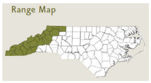
Brook trout are found in the shaded (western) counties in North Carolina