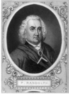
"Peyton Randolph, 1721-1775."