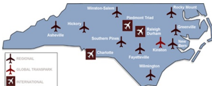
Figure 23. Commercial Airports

North Carolina's second tier of commercial airports includes airports with service by multiple carriers, and it includes Asheville, Wilmington, and Fayetteville. The third tier of airports that have a combination of commuter air service and general aviation are located in New Bern, Greenville, Jacksonville, Kinston, Rocky Mount/Wilson, Hickory, Southern Pines, and Manteo. These are airports with service primarily connecting with the three Tier One airports in the state and limited service to other cities. A current trend is for the so-called "low cost" airlines to initiate service in airports in all three tiers. Figure 23 shows the approximate locations of the primary airports in North Carolina. In addition to these commercial airports, there are approximately 60 public airfields that serve general aviation, and over 300 privately-owned, private-use airports. These smaller airports provide important travel mode options to many residents and visitors to the state.