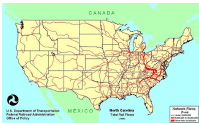
Figure 25. North Carolina Total Rail Freight Flows

Figure 25 illustrates graphically the total rail freight flows into and out of North Carolina. The highest volume of freight traffic is on the CSX line connecting Charlotte to the Port of Wilmington, the Norfolk Southern/NCRR line from Charlotte through Greensboro to Raleigh, and the CSX line that runs north-south roughly parallel to Interstate Highway 95. Those three corridors handle approximately 40 million tons of freight annually. Table 10 shows the total volume of rail shipments statewide in 2008, compared with other states on the Atlantic coast.